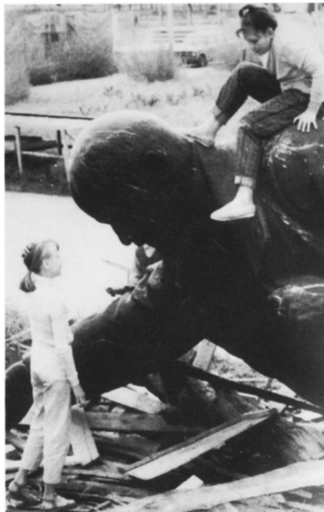
Vilnius, August 30, 1991. Toppled Lenin.

Let us concede one or two points. Of course The Society of the Spectacle was conceived as a work of "high theory," and depends on a dialogue with texts, mostly drawn from the deep past of Marxism, German philosophy, and French classical literature, which it finds a way to ventriloquize and exacerbate. (Debray's suggestion that the book "admits to plagiarism only in extremis"—in a single thesis toward the end—is pure bad faith. Quite apart from the fact that Debray knows perfectly well, as everyone does, that at that moment Debord is quoting Lautréamont on plagiarism, The Society of the Spectacle voices its dependence on the past in every paragraph. That dependence is far deeper and weirder than a speed-reader like Debray has time to bother with.) The question to ask is what might have been the strategic point of such a way of writing in 1967. Dates matter. Althusser's For Marx and Reading "Capital" were two years old, and sweeping the Left in Europe. When Debray says airily that "we were all Feuerbachians in our