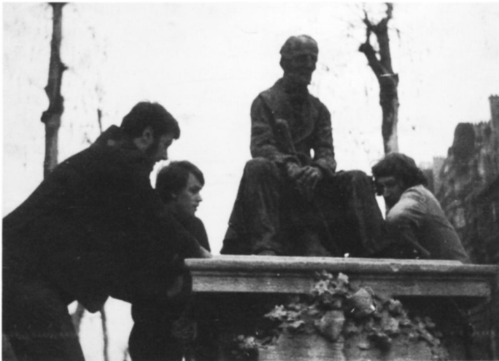
Paris, Place Clichy, March 10, 1969. Anarcho-Situationist “commandos” installing a replica of Charles Fourier’s statue on a plinth left empty since the removal of the original by the Nazis. 13

conditions which in our view have circumscribed our practical activity—that activity conceived as means and ends, inseparably—and thus the issue does not depend merely on an individual’s capacity to understand, or willingness to espouse, particular theoretical positions. (As for the theoretical positions themselves, we naturally hope that all who are able, in the full sense of the term, to appropriate them, will make free use of what they appropriate.) Very schematically, we may say that the S.I. considers that what it can do at present is work, on an international level, for the reappearance of certain basic elements of a modern-day revolutionary critique. The activity of the S.I. is a moment which we do not mistake for a goal : the workers must organize themselves, they will achieve emancipation through their own efforts, etc. . . . We cannot accept the idea that numerical “reinforcement” is a virtue per se. It can be harmful from an internal point of view, if it produces an imbalance between what we really have to do and a membership which can serve those ends only in an abstract way, and which is thus subordinate, whether for geographical or other reasons. It can be harmful from an external point of view, to the extent that it presents another example of the Will to Pseudo-Power, after the