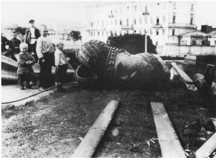
Moscow, 1917. Toppled Alexander III.

abbreviated) version of Debray's eulogy in its issue for November/December 1995. 5 This was only the second time in the Review's history that it had addressed—and misrepresented—the question of the Situationists (the first, of which more in a moment, came in 1989, after a quarter-century of eloquent silence 6 ). But contradictions will out, and as luck (or bad management) would have it, the Debray piece was placed in nice juxtaposition to lengthy and reverential discussions, in the same issue, of Eric Hobsbawm's "history of the short twentieth century"—his "report," as one wag put it, "to a Central Committee that just isn't there any more." The very idea of pressing too hard on Hobsbawm's omissions and excuses as a historian was denounced a priori by NLR as "anti-Communist." One law for young-Hegelians, it seems, and another for unrepentant Stalinists. To have been over-optimistic about the revolutionary potential of the Watts proletariat is one thing; to have spent one's life inventing reasons for forced collectivization, show trials, the Great Terror, the suppression of the East German and Hungarian uprisings, and so on ad nauseam , quite