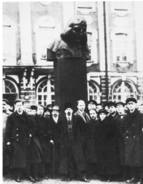
Petrograd, 1918. Dedication of a statue of Heinrich Heine (stage center: Lunacharsky).