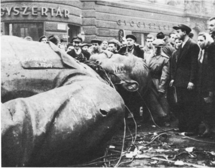
Budapest, October 23, 1956. Toppled Stalin.

that year). We are obviously biased judges, but we persist in thinking that these texts are classics of Marxist analysis. (In both cases the S.I. benefited from having members who possessed real knowledge of the language and history of the countries concerned, as opposed to forming opinions from books by fellow-travelers and editorials in Le Monde .) We wonder if those who now dismiss the “political” S.I. could come up with commentaries on the same or comparable subjects from the same period that strike them, in retrospect, as even roughly as good. Good meaning disabused and passionate.