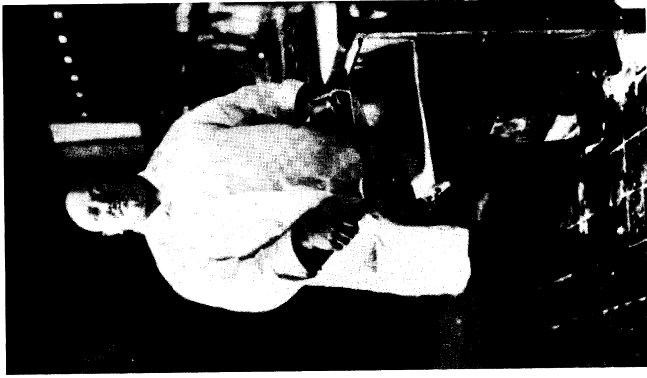
Pastry Cook.