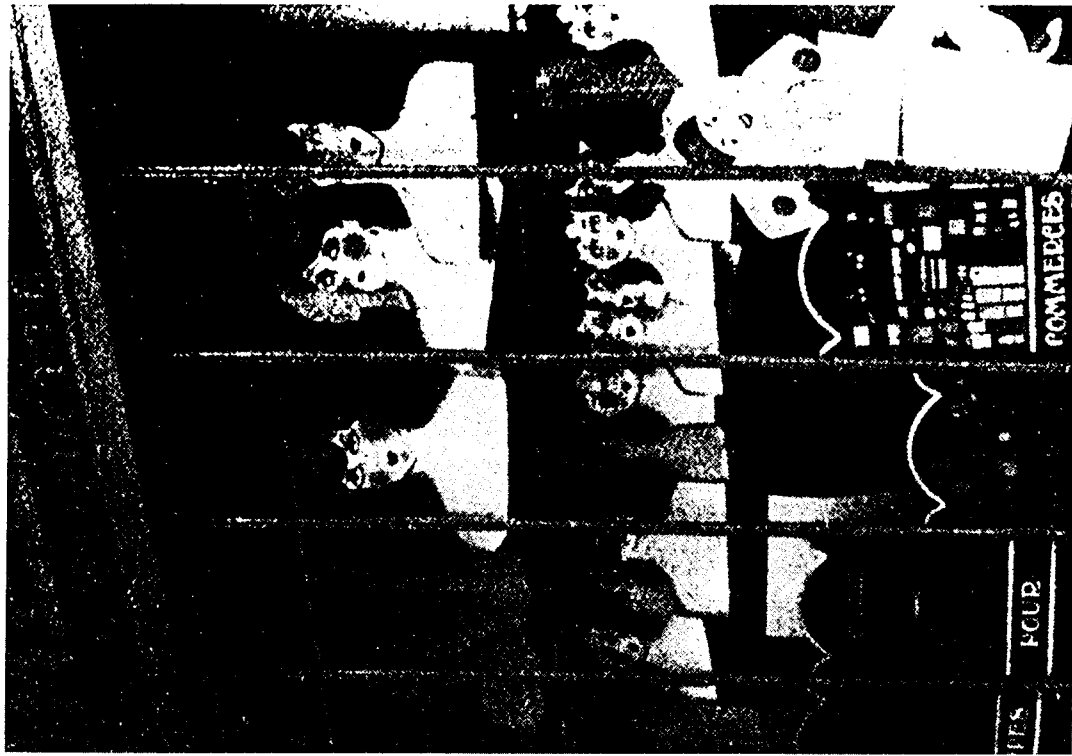
Display Window.