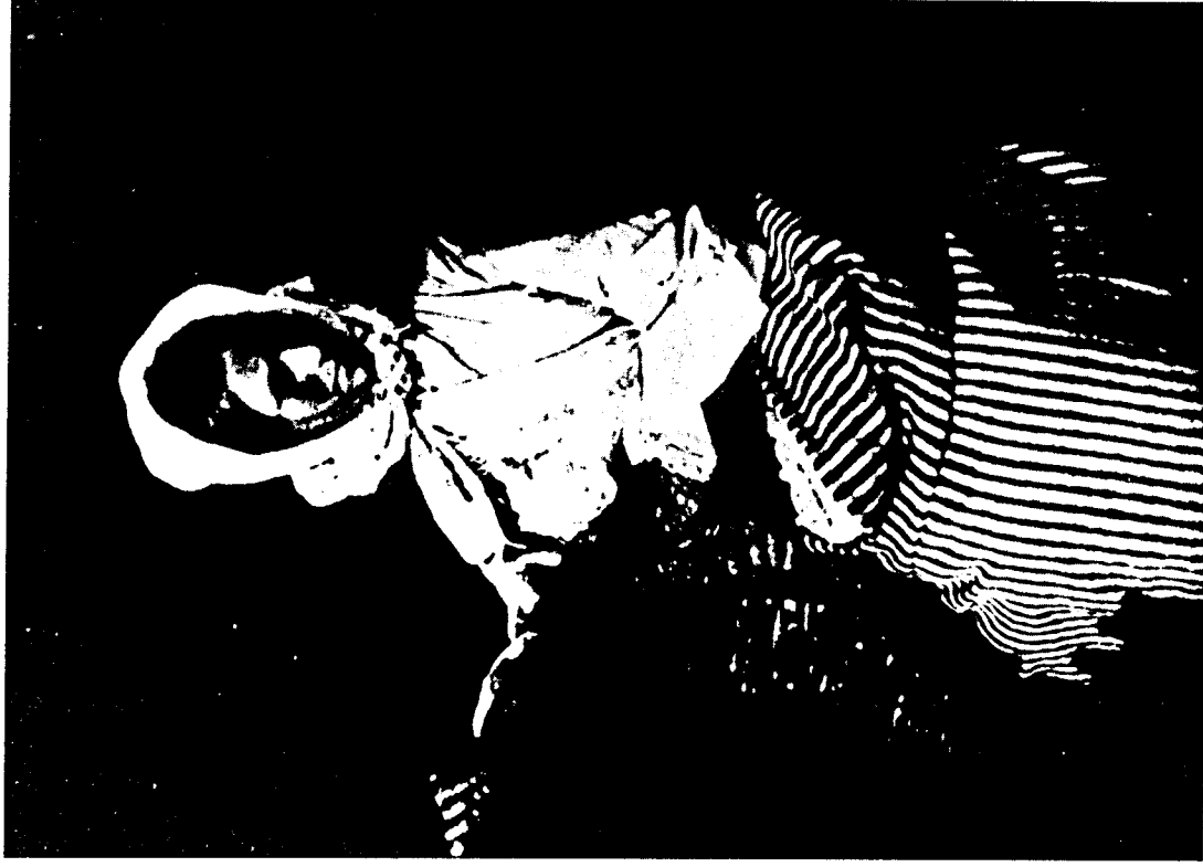
Neuhaven Fishwife.

Daguerre's photographs were iodized silver plates exposed in the camera obscura, which had to be turned this way and that until, in the proper light, a pale gray image could be discerned. They were one of a kind; in 1839 a plate cost an average of 25 gold francs. They were not infrequently kept in a case, like jewelry. In the hands of many a painter, though, they became a technical adjunct. Just as seventy years later Utrillo painted his fascinating views of Paris not from life but from picture postcards, 5 so the highly regarded English portrait painter David Octavius Hill based his fresco of