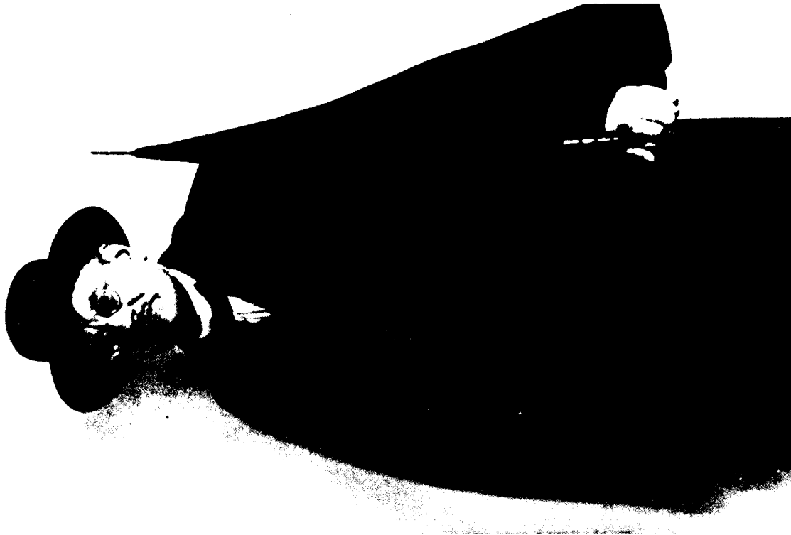
Parliamentary Representative (a Democrat) . Photo by August Sander.

And Tristan Tzara, 1922: "When everything that called itself art was stricken with palsy, the photographer switched on his thousand-candle-power lamp and gradually the light-sensitive paper absorbed the darkness of a few everyday objects. He had discovered what could be done by a pure and sensitive flash of light—a light that was more important than all the constellations arranged for the eye's pleasure." 22 The photographers who