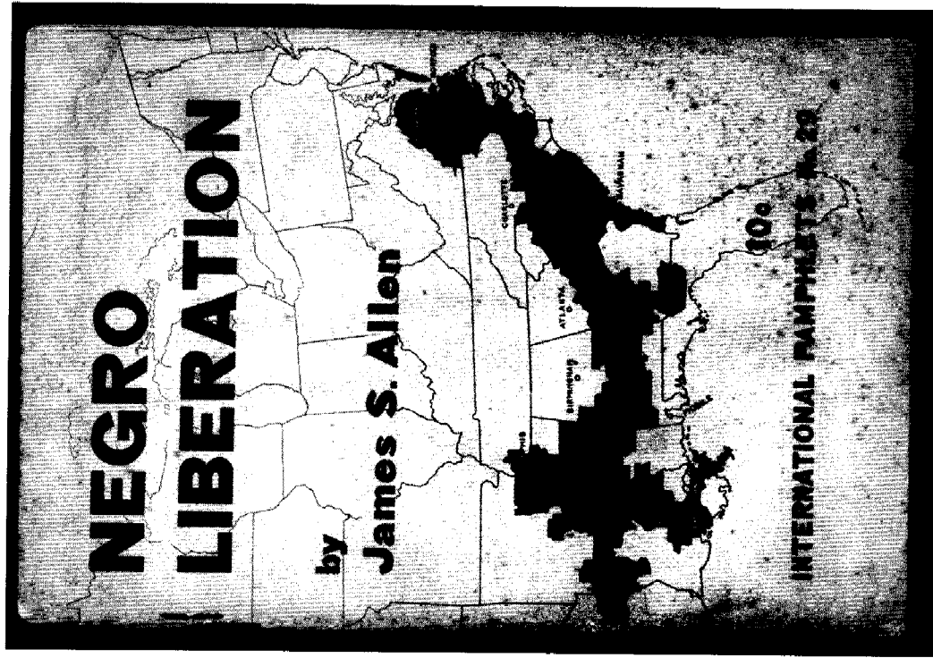
Cover of Communist Party pamphlet by James S. Allen (International Pamphlets, 1932)

Still more: Are the Negro masses even aware of the fact that there is such a thing as a Black Belt in which they constitute the majority of the population and which, according to the Moscow statisticians who invented the new slogan in 1928, is the basis for a Negro nation? It is no exaggeration to say that 99 percent of the American Negroes have not the slightest knowledge of its existence; the single other percent is